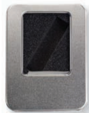
Square Window Tin