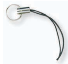
Key Ring String