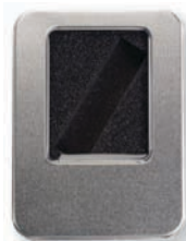
Square Window Tin