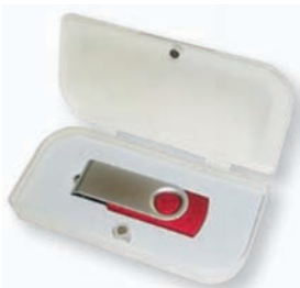
Magnetic Plastic Case