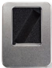
Square Window Tin