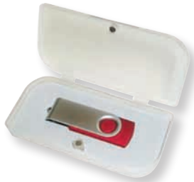
Magnetic Plastic Case