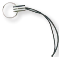
Key Ring String