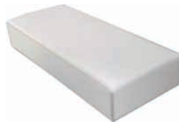
White Paper Tuck Box