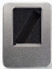
Square Window Tin