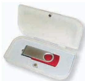
Magnetic Plastic Case