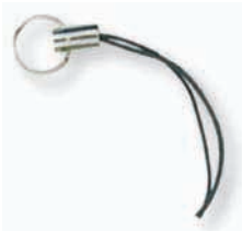
Key Ring String