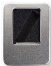
Square Window Tin